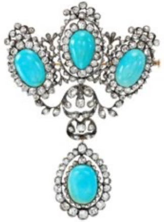
Turquoise and diamond brooch, late 19th century