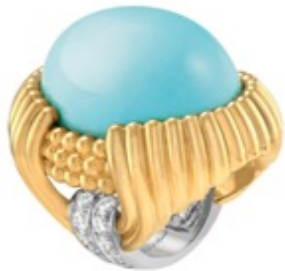
featuring a cabochon turquoise and diamonds set in 18-karat yellow and white gold; $140,000.