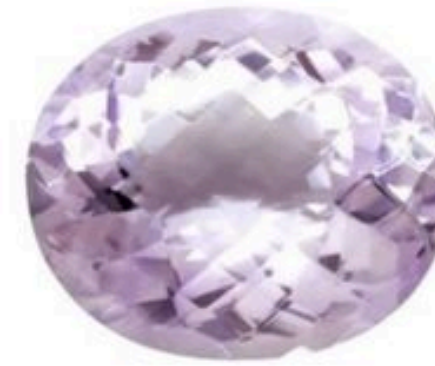
Rose de France